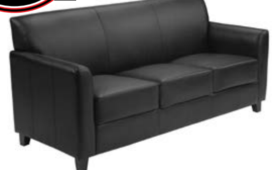
Black Leather Couch