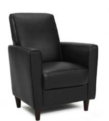
Black Leather Chair