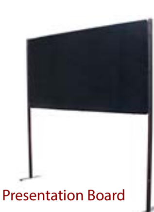
entation Board 3'x6' Slat Wall