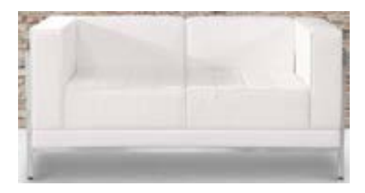
Leather Loveseat (available in black or white)