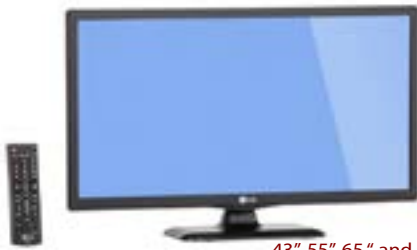
43", 55", 65" and 75" Flat Panel Displays w/Power Cord and Remote