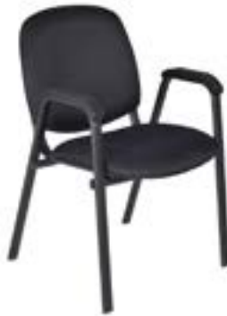
Padded Arm Chair