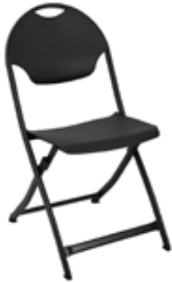
Premium Folding Chair - Black