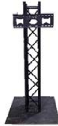
Display Stand (Truss)