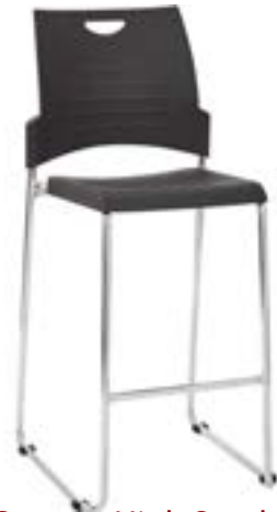
Counter High Stool