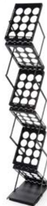
Literature Rack (black and silver available)