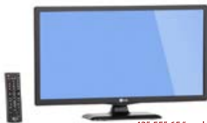
43", 55", 65" and 75" Flat Panel Displays w/Power Cord and Remote