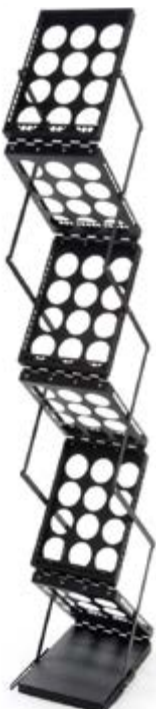
Literature Rack (black and silver available)