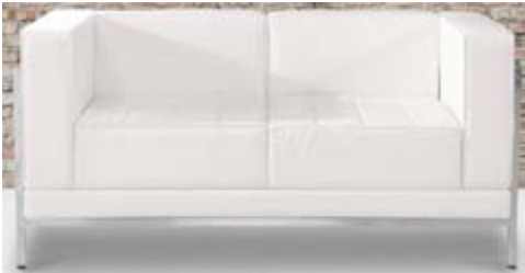
Leather Loveseat (available in black or white)