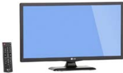
43", 55", 65" and 75" Flat Panel Displays w/Power Cord and Remote