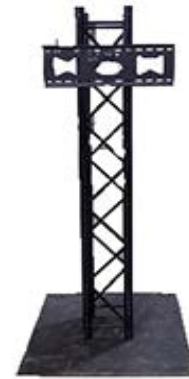
Display Stand (Truss)