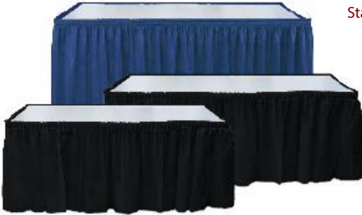
Standard & Counter High Skirted Tables (4 ft., 6 ft. and 8 ft. lengths available)