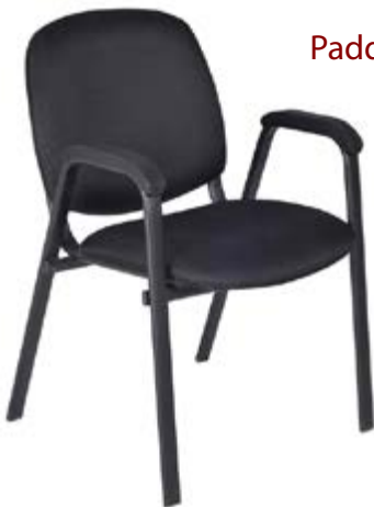
Padded Arm Chair