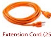
Extension Cord (25')