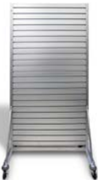
3'x6' Slat Wall