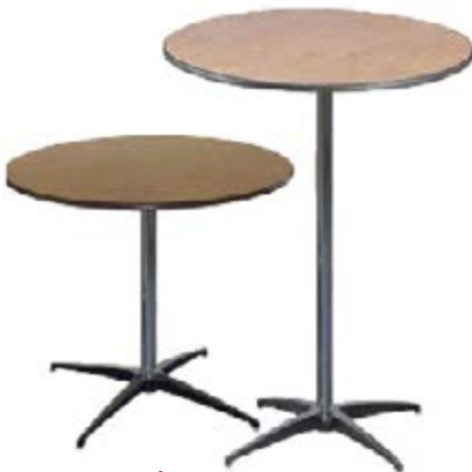
30" Lowboy & Highboy Tables