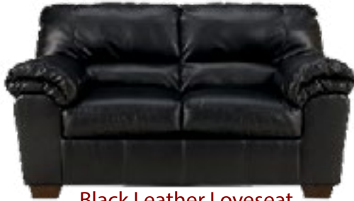
Black Leather Loveseat