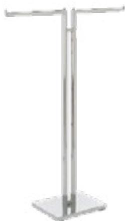
Adjustable T-Rack/ Bag Holder