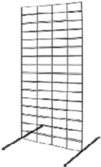
Black 6'x2' Gridwall