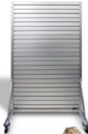
3'x6' Slat Wall