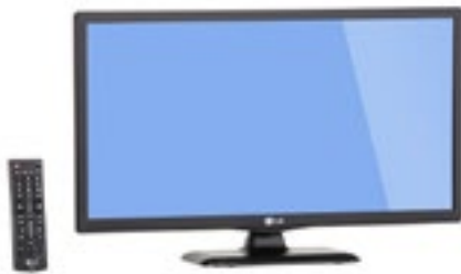
32", 43", 55" and 65" Flat Panel Displays w/Remote