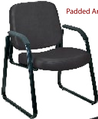
Padded Arm Chair