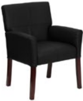
Black Leather Chair