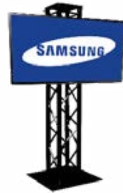
Display Stand (Truss)