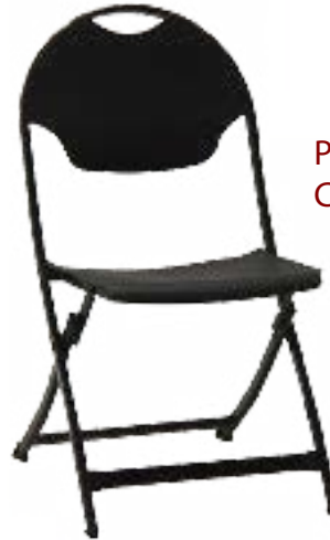
Premium Folding Chair - Black