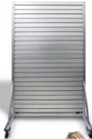
3'x6' Slat Wall