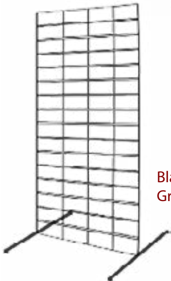
Black 6'x2' Gridwall