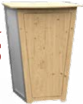
Tapered Counter (plain or w/custom graphic)