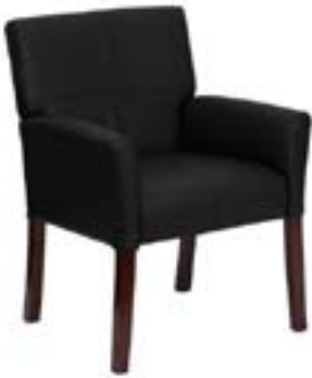
Black Leather Chair