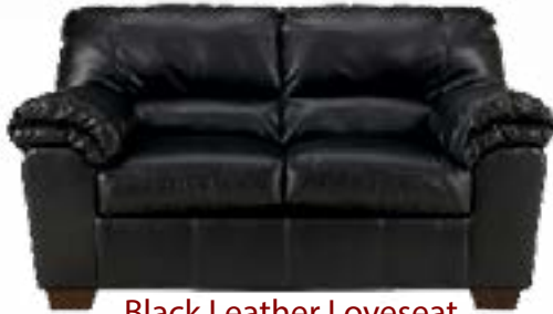
Black Leather Loveseat