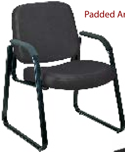
Padded Arm Chair