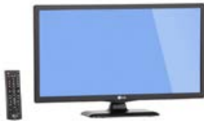
32", 43", 55" and 65" Flat Panel Displays w/Remote