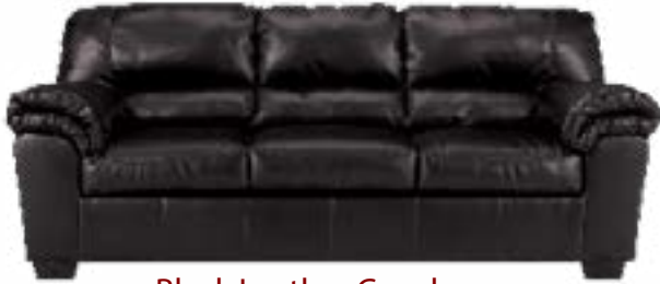
Black Leather Couch