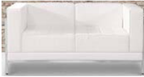
Leather Loveseat (available in black or white)