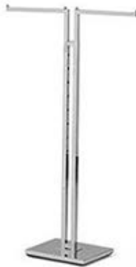
Adjustable T-Rack/ Bag Holder