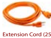
Extension Cord (25')