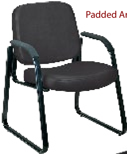
Padded Arm Chair