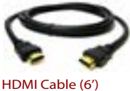
HDMI Cable (6')