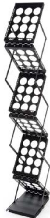
Literature Rack (black and silver available)