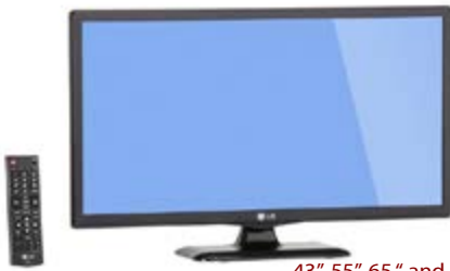
43", 55", 65" and 75" Flat Panel Displays w/Power Cord and Remote