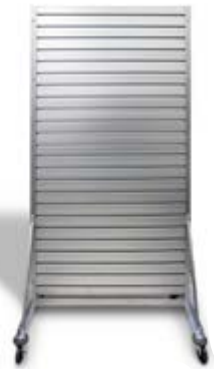
3'x6' Slat Wall