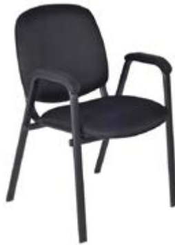
Padded Arm Chair