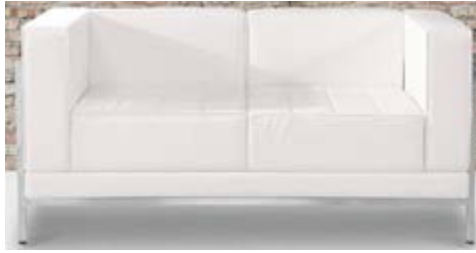
Leather Loveseat (available in black or white)